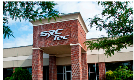
North Syracuse, N.Y. Facility