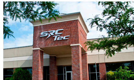
North Syracuse, N.Y. Facility

5801 East Taft Road North Syracuse, New York 13212 Phone: 315.452.8700 or 866.913.3559