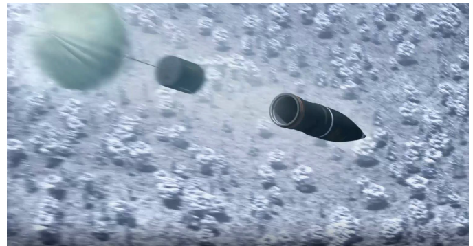
Silent Impact uses a 155mm munition shell as a delivery system, extending friendly cyber, PNT and EW capabilities far behind enemy lines.

Emerging requirements from the U.S. Army demand single, distributed and rapidly (re)deployable small form factor